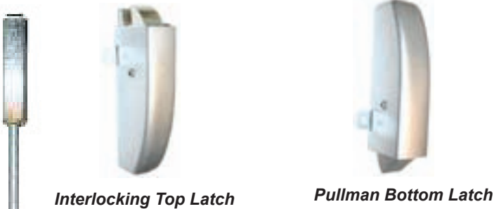
Interlocking Top Latch